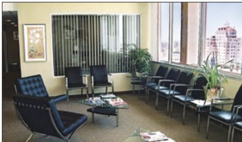
Larchmont office waiting room

Dougherty Laser Vision recently transformed its Los Angeles surgery center with a complete makeover. The remodeled center now occupies the entire 10 th floor penthouse of the Larchmont Medical Plaza, and boasts 10 full-time staff members. The floor plan includes separate suites for general ophthalmology and refractive surgery, as well as new consultation rooms and administrative offices. Panoramic north and south views offer patients an opportunity to test their newly corrected vision on such L.A. landmarks as the Hollywood sign and Catalina Island. The styling is contemporary yet soothing, and reflects Dougherty Laser Vision's status as a leader in advanced vision care. Dougherty's Los Angeles office is located at 321 North Larchmont Blvd. in Larchmont Village.